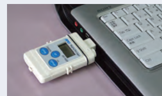
and Retrieve the Data!

As with the AD-1687 weighing environment logger, the AD-1688 becomes especially handy where a PC or printer cannot be placed near the weighing instrument, such as clean rooms.