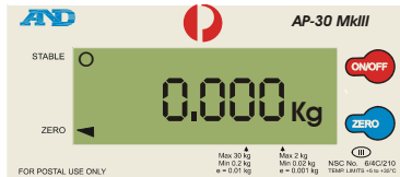
Operator Display & Controls